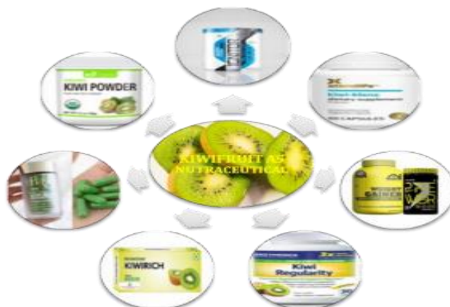
Figure 2. Shows pharmacological and medicinal benefits of different parts of Actinidia deliciosa as depicted by Guroo et al., 2017