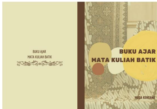
Figure 2. Teaching module of Batik course

The validation of teaching modul for Batik course is carried out by expert in that field. The product for the teaching module in the batik courses is shown if Figure 2 and the validation results of this teaching module can be seen in Table 2.