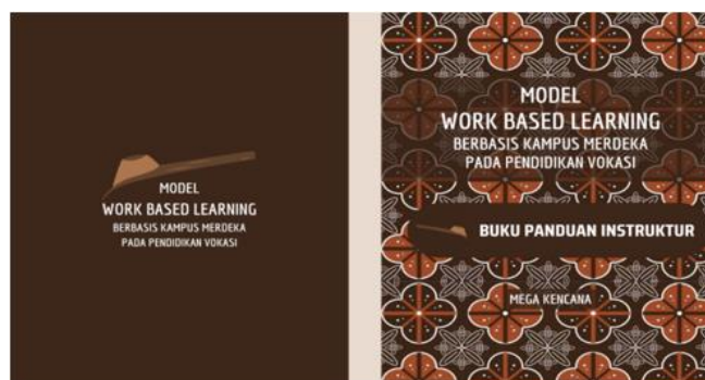
Figure 5. Instructur Manual Book for Batik Course

The instructur manual book for the work-based learning model in vocational education based on the concept of Kampus Merdeka can be seen in Figure 5 and its validation results is presented in Table 5.