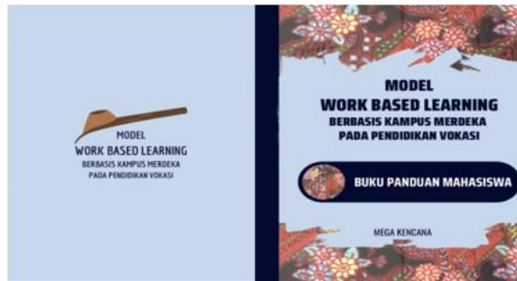
Figure 4. Student Guidebook for Batik Course

The validation results of the student guidebook is shown in Table 4.