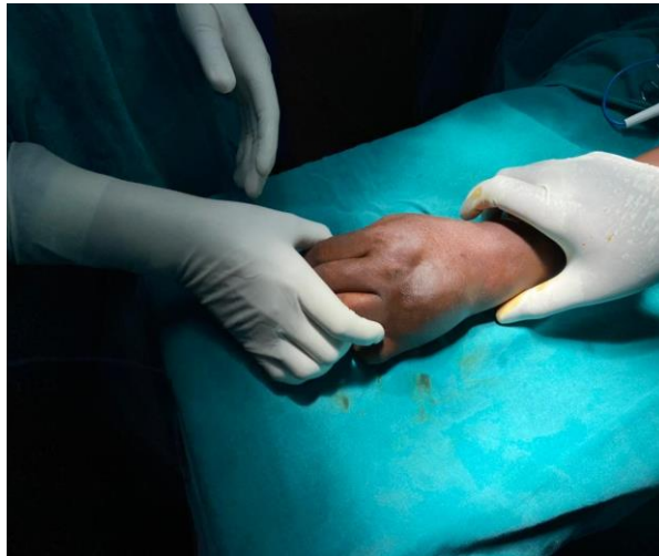
Figure 1: Clinical Photograph of the Swelling before the surgery

The fingers and the surrounding area around the swelling was found to be well vascularized and no surgical marks of previous operation or any injury was visible. The consistency of the swelling was found to be variable from hard to tender with irregular thickening around the borders. The underlying bone of metacarpal could not be palpable separately and the overlying skin was shiny with dilated veins. There was some restriction of movements at 4 th and 5 th Metacarpophalangeal joint.