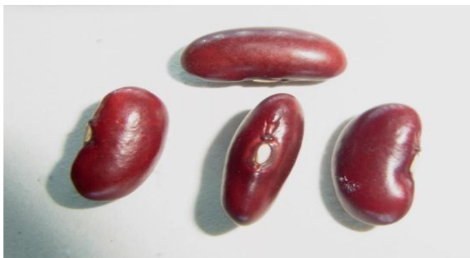
Figure 2 Seeds of Phaseolus vulgaris .

According to a number of studies, common beans contain a significant amount of numerous essential nutrients, including protein, carbs, fibre, minerals, and vitamins. Flavonol glycosides, anthocyanins, and condensed tannins (Proanthocyanidins) are just a few examples of the bioactive compounds that may be found in these seeds. Not only these molecules are responsible for the seeds' brilliant colour, but they also play a role in the seeds' biological activity. Clinical studies have shown that consuming beans is supposed to provide the benefit as they possess lower glycemic index thereby leading to reduction in likelihood of developing type 2 diabetes. This is because beans have a high polyphenol content, which renders potent antioxidant effect. Beans have a high polyphenol content. Consumption of beans has been associated to a reduction in the risk of ischemic heart disease / other cardiovascular disorders, stomach and prostate cancer, obesity, stress reduction, anxiety and depression in the elderly, Beans have been an important part of the cuisine of Mexico for centuries. According to the study, Mesoamerica, namely the area to the west and south of Mexico, is the place where beans first grew and were domesticated. South America served as the species' last habitat before becoming extinct (2) .