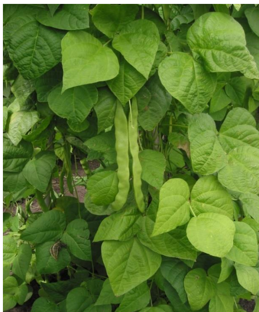
Figure 1 Plant of Phaseolus vulgaris L.