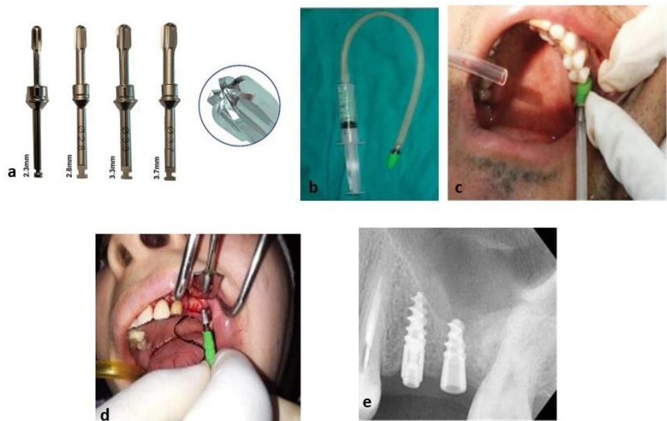
Figure 2: (a) CAS Kit osteotomy drills (b) CAS Kit hydraulic lifter (c) hydraulic lifter placed in osteotomy site (d) dental implant placement in prepared osteotomy location (e) A radiographic picture of the sinus floor with a bone graft at the apical region of the implant.