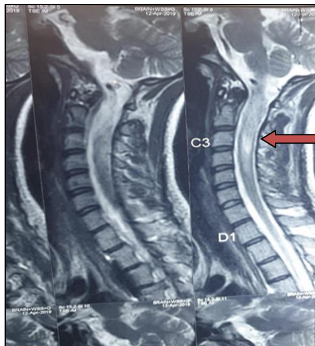
Fig 1: MRI-Cervical Spine demonstrating T2 hyperintensities from C1 to C4 level.

The patient was diagnosed as anti aquaporin-4 associated longitudinally extensive transverse myelitis (NMO) and was given 5-day course of intravenous methylprednisolone. As there was little improvement in her clinical status, she underwent 7 cycle of plasmapheresis. She showed gradual improvement and after 3 months she was able to walk with support, had normal sensation in her legs and normal sphincter functions.