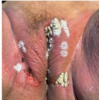
Figure 3. The current therapeutic procedure was performed with a combination of hefyrcauter and 90% TCA of the lesion