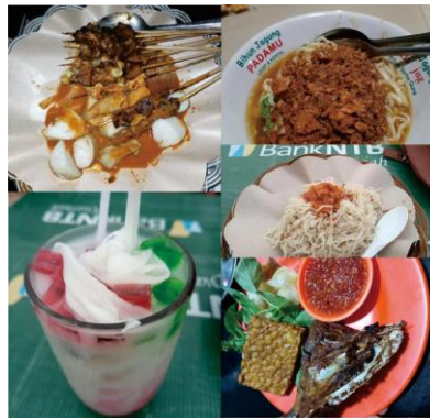
Figure 2. Lombok's Ampenan Beach gastronomy

On the basis of the foregoing interview, it can be concluded that the flavor of various types of food is commensurate with the price charged, leading visitors to believe that the cuisine offered is capable of creating a favorable impression of Ampenan Beach tourism. Traditional cuisine that is representative of a region might be a particular draw for tourists.