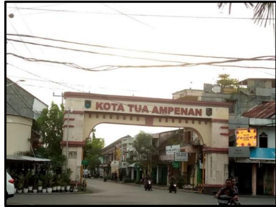
Figure 4. The entrance to Lombok's Ampenan Old Town

Several variables, including tourist attractions, cuisine, facilities and services, accessibility, and supporting institutions, play a part in enhancing Ampenan Beach Lombok's image as a tourism destination, as determined by the analysis of the interview data presented above. However, cuisine is the primary aspect that attracts travelers. This is supported by positive comments from respondents interviewed by the author, to the effect that tourists visit because the food tastes good, there are a variety of foods available, including traditional snacks, cold and warm drinks, and a variety of main dishes, including seafood, meatballs, chicken noodles, satay-satean, and typical Lombok regional cuisine, and the price of existing food is still affordable, supported by good service from vendors, and et cetera.