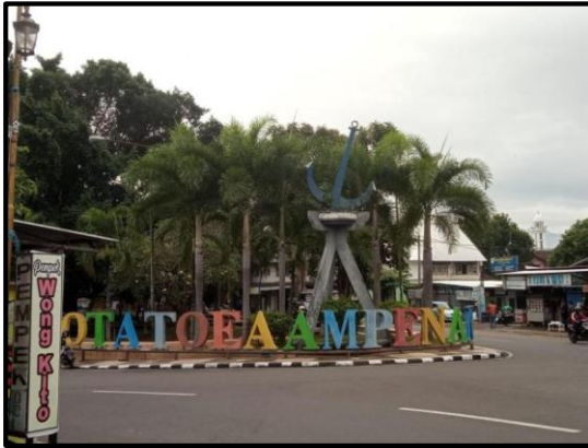
Figure 3. Old Town Street in Ampenan, Lombok