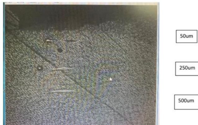
Figure. 1 : microscopic image of indentations obtained at 50 \mu\text{m} , 250 \mu\text{m} and 500 \mu\text{m} from the deepest point of the cavity.