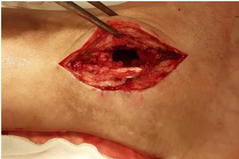
Figure 1: Bone defect after osteonecrectomy

The treatment options for osteomyelitis in both groups corresponded to generally accepted principles and consisted of surgical intervention and anti-infectious chemotherapy. The surgical method of treatment was the main one in both groups. The first stage of surgical intervention was carried out radical sanitation of the osteomyelitis focus with osteonecrectomy (figure 1). The fistula tract was excised after it was stained, sequestered bone, pathological granulations were removed, and the bone marrow canals were opened. The viability of bone tissue was determined by the appearance of capillary bleeding ("blood dew") from the walls of the formed bone defect. Additionally, the surgical wound was treated with solutions of antiseptics.