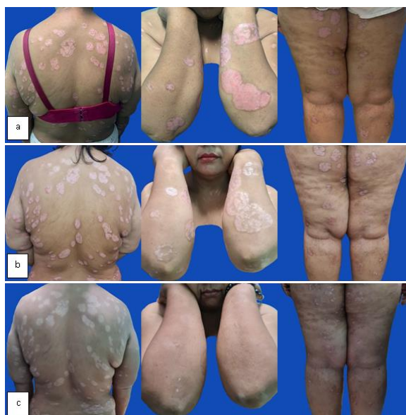
Figure 2. The physical examination of the patient (a) before the secukinumab treatment, (b) after the 4th injection, and (c) two weeks after the last injection of secukinumab