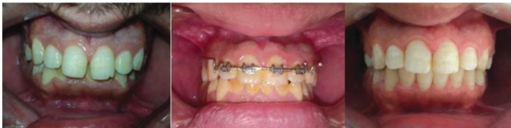
Figure 3. a case presenting PMG before, during, and after the intrusion