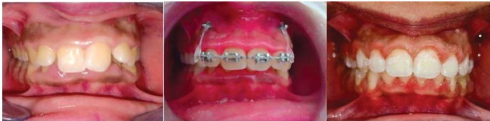
Figure 2. a case presenting AMG before, during, and after intrusion

X indicates mean change; SD, standard deviation; * P < .05; ** P < .001