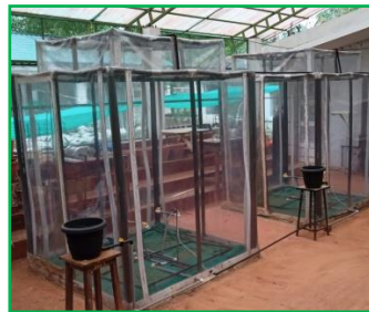
Fig I Chambers (control and treated) installed for CO 2 enrichment experiments

carotenoid contents were estimated using DMSO method [10]. Anthrone method [11] is employed for the estimation of total carbohydrates. Lowry's reagent and Folin ciocalteus phenol reagent was used for assessing the concentration of protein [12]. Protocol of [13] was used for the estimation of total phenol content.