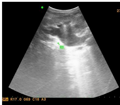
Image 6. Right renal calculus with hydronephrosis

is more prevalent in women and involves rectal flora colonisation of the urethra, the most common of which is E. coli [2]. [Image 6& Image 7]