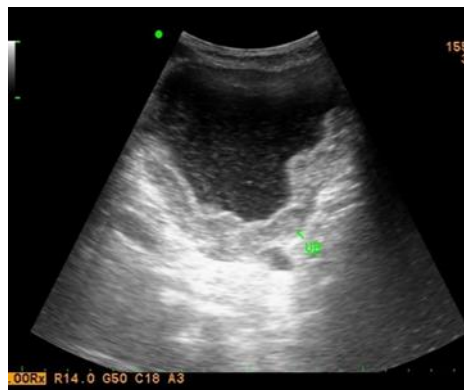
Image 7. Thickened wall of the urinary bladder with features of cystitis