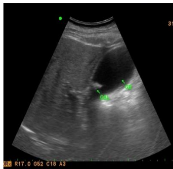
Figure 4. Gall bladder calculi (cholelithiasis)

Sonographic findings include gall bladder wall thickening (>3mm), lumen distension (>4cm), gall stones, pericholecystic fluid accumulation, and a positive sonographic Murphy's sign. The following criteria are used to diagnose acute cholecystitis: [5] - local evidence of inflammation (Murphy's sign), systemic sign of inflammation (elevated leucocytes). [Image 4]