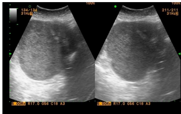
Image 5. Right adnexal mass in a female