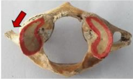
Fig.7 Incomplete foramen transversarium