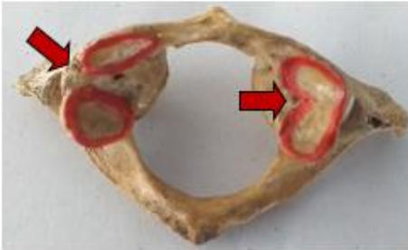
Fig.1 Complete separation of the Left SAF Fig.2 Dumble shaped superior articular facets Reniform Right SAF ( constriction on the medial side)