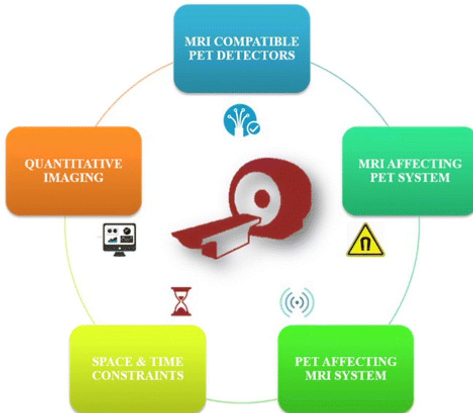
Figure 2. Difficulties in Combining MRI and PET (17)