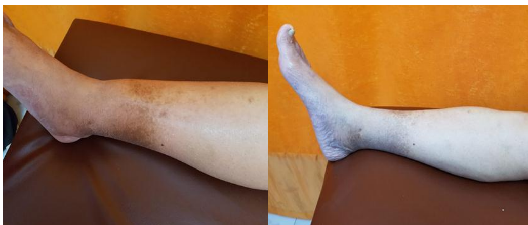
Affected limb before treatment Affected limb After 2 weeks of treatment Figure 3. shows affected lower limb with cellulitis before and after treatment.