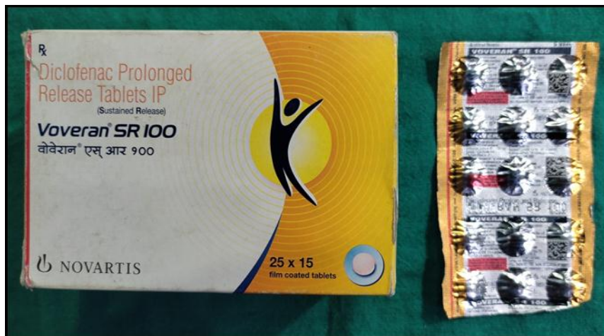
Figure 4. Oral Diclofenac Sustained Release Tablet (Voveran SR 100)