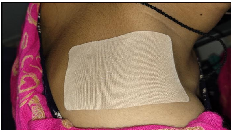
Figure 5. Diclofenac Transdermal Patch on Patient at Right Shoulder