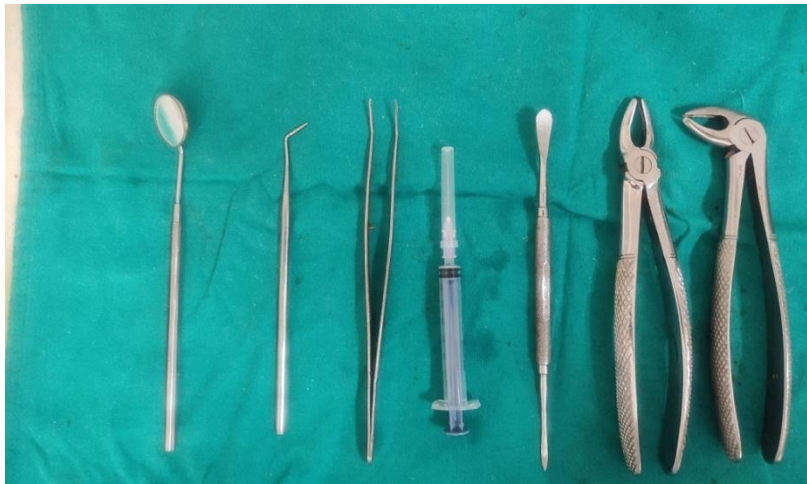
Figure 1. Armamentarium used for premolars extraction

of Diclofenac and is designed to remain at the site of application for 24hrs. Each 50sq.cm patch contains 100mg of Diclofenac Diethylamine as its active ingredient. The device consist of polymer matrix that controls the release of the drug and an impermeable backing membrane that prevent leaching of the drug from top. The adhesives fasten the device to the skin during use. The patch delivers slow release of the drug into body over time, resulting in long term effectiveness and added convenience. subject were asked to report pain intensity score chart for three postoperative days, following to submit the 5-point pain intensity scale for evaluation and were also asked to report pain relief score chart three post-operative days, following to submit 5- point pain relief scale for evaluation. The data obtained from study subjects were statistically evaluated using Mann-Whiteny U test.