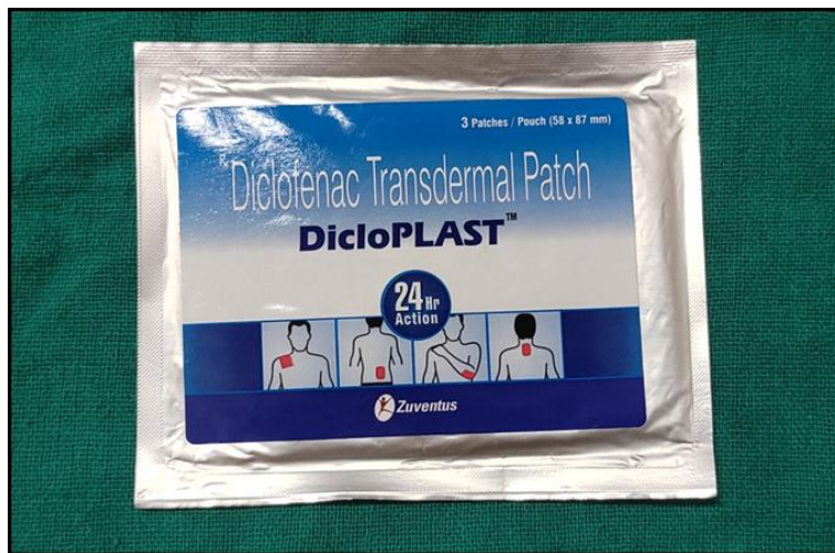
Figure 3. Diclofenac Transdermal Patch (DicloPLAST)