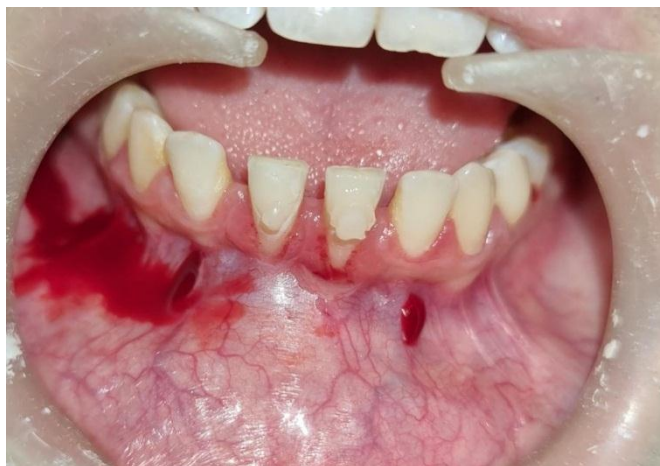
Figure 5: Vestibular Incision for Sub-periosteal Tunnel Access