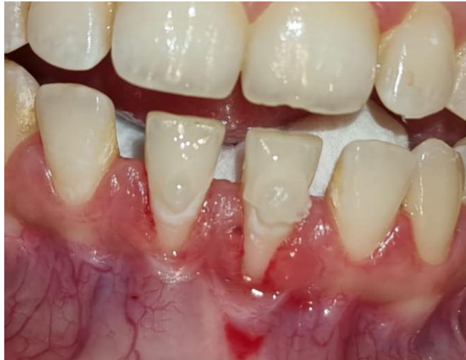
Figure 4: After Removing the Orthodontic Separators