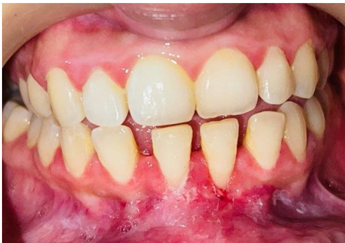
Figure 10: Healing after 4 weeks.