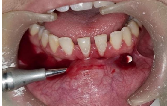
Figure 6b: Tunnel extended 2mm beyond Mucogingival Junction