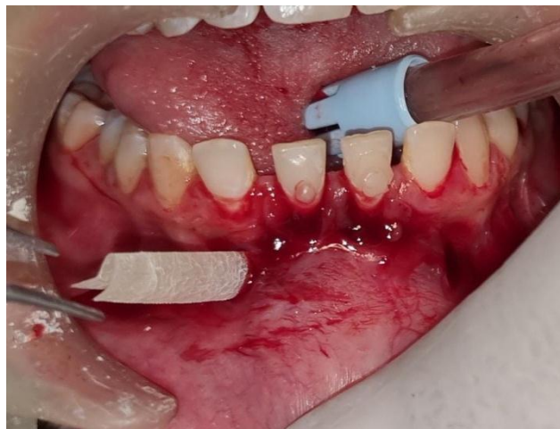
Figure 7a: Collagen Membrane inserted using Tweezer