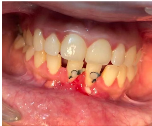
Figure 9: Healing after 1 week