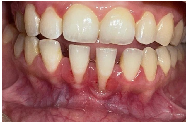
Figure 1: Pre Operative

The N-VISTA resulted in patient centred esthetic outcome with increased patient comfort and reduced surgical visits. The supra-periosteal tunnel provided greater vascularity and the resin button anchored sutures offered a tension free advancement. Hence, this minimally invasive surgical technique may allow the clinicians to attain functionally and esthetically pleasing root coverage in the mandibular anterior area. Future comparative studies may be undertaken to prove its efficacy over time.