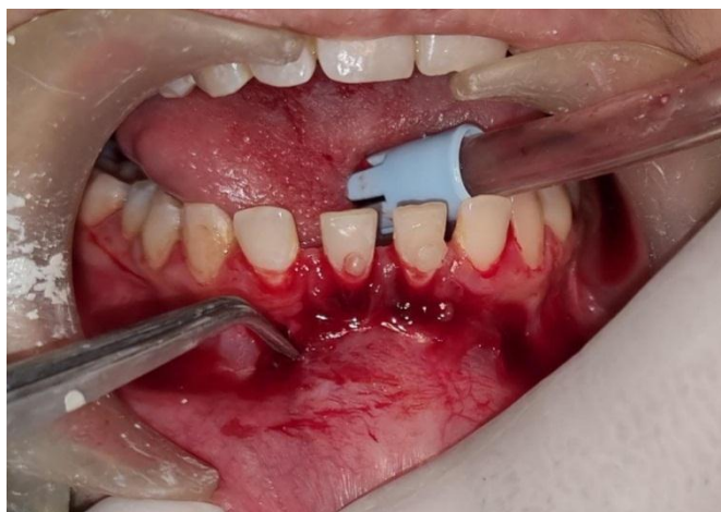
Figure 7b: Collagen Membrane inserted using Tweezer