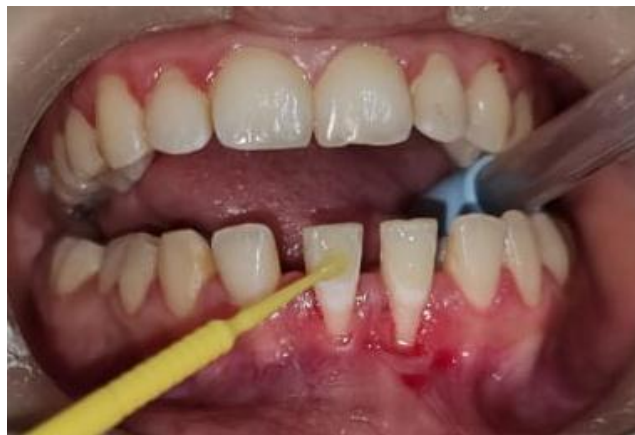
Figure 2: After Etching and Bonding