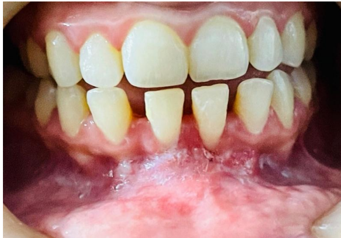
Figure 11: Healing after 9 months