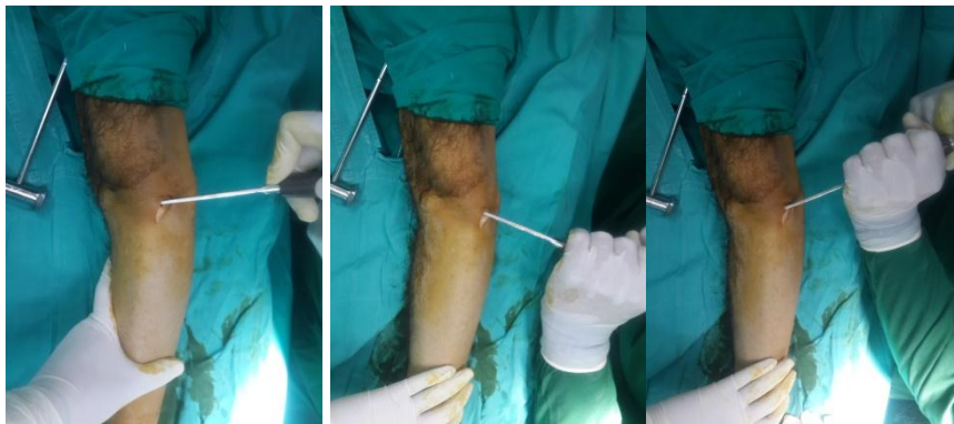
Figure (3): crushing of the cancellous bone by swinging the osteotome proximally and distally

3-Osteotomy of the lateral cortex only and crushing of the cancellous bone by swinging the osteotome proximally and distally.