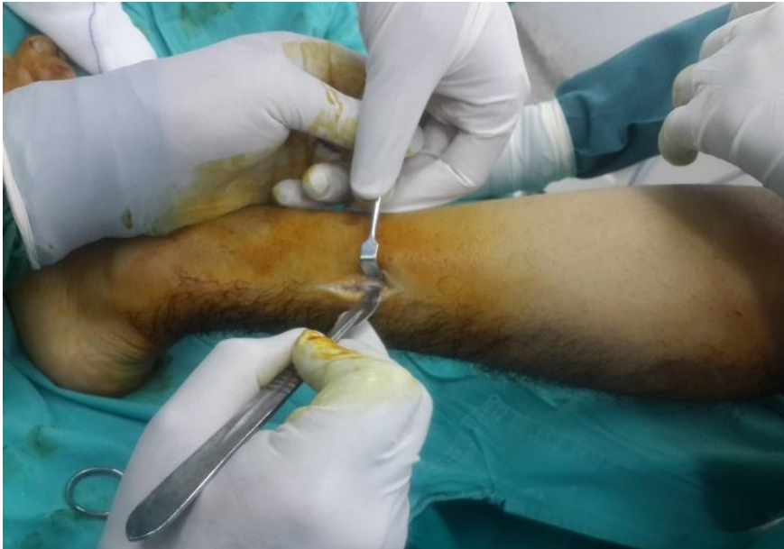
Figure (1): Fibular osteotomy is performed at the middle of the fibula

1-Fibular osteotomy is performed at the middle of the fibula.