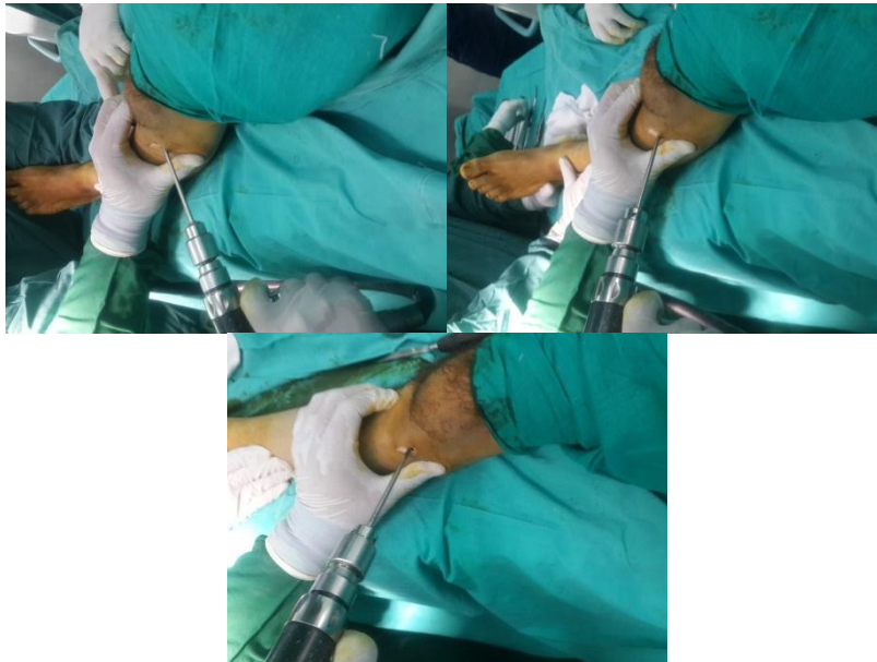
Figure (4): drilling of the anteriomedial , medial , posteromedial then posterior cortex in an ordered fashion

5- 4.5 or 3.2 mm drill bit is used to drill the anteriomedial , medial , posteromedial then posterior cortex in an ordered fashion.