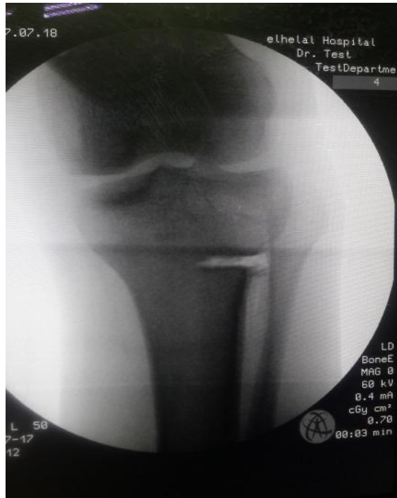
Figure (4): lateral window

5- 4.5 or 3.2 mm drill bit is used to drill the anteriomedial , medial , posteromedial then posterior cortex in an ordered fashion.