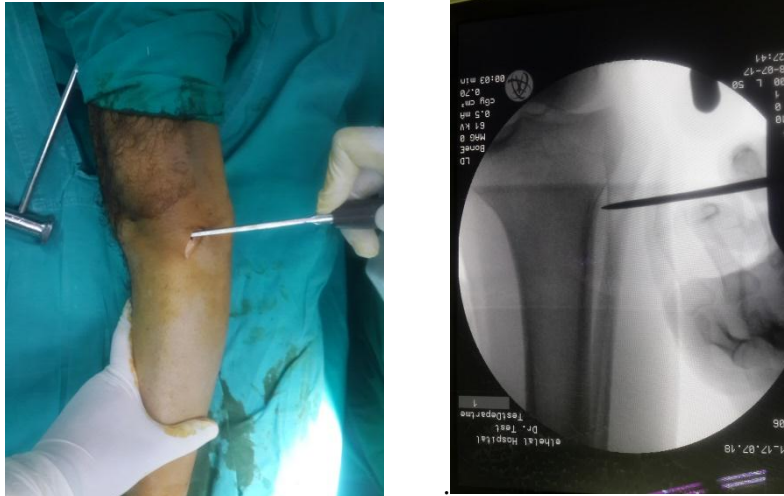
Figure (2): Upper tibial osteotomy : skin incision is small medial 1-2 Cm incision in upper tibia just distal to tibial tuberosity

2-Upper tibial osteotomy: skin incision is small lateral 1-2 Cm incision in upper tibia just distal to tibial tuberosity.