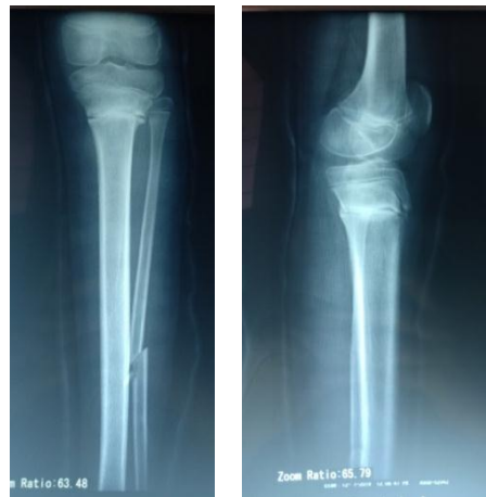
Figure (8): Post operative long film xray