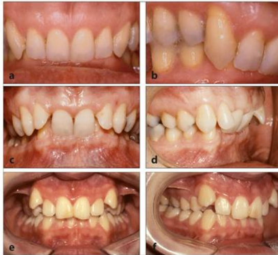
Fig 1. Class II, division 2 malocclusions. (a and b) Type A. With excess space in the maxillary dental arch, all four maxillary incisors can tip palatally, and the canines attain a correct position in the dental arch. (c and d) Type B. With limited space, the maxillary central incisors tip palatally, and the lateral incisors tip labially. (e and f) Type C. With marked shortage of space, the four maxillary incisors tip palatally, and the canines emerge buccally outside the dental arch. 19