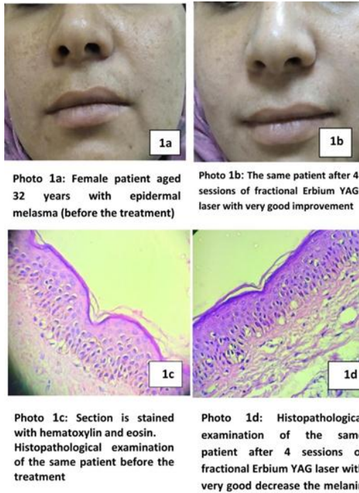
Fig 1. Patient with Epidermal Melasma Before And After The Laser Treatment