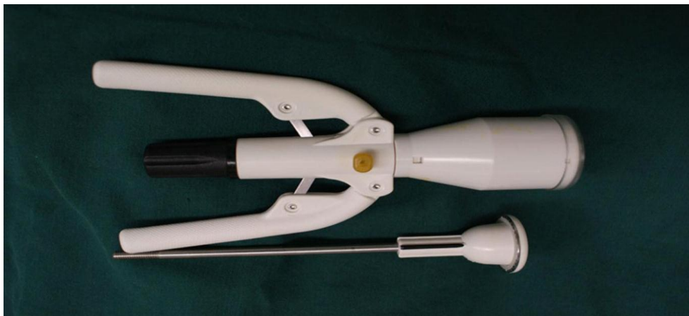
Figure : The circular stapler comprises an inner bell and an outer bell. The inner bell is designed to protect the glans. The outer bell has two cutting trigger handles, a regulating screw, a circular blade, staples, a safety shield, and a bolt. The circular blade and staples are hidden in the outer bell and protected by the safety shield and bolt.