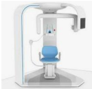
Figure 2. CBCT machine

Craniofacial CBCT were developed to counter some of the limitations of conventional CT scanning devices. In craniofacial CBCT the object to be evaluated is captured as the radiation falls onto a two-dimensional retractor. This simple difference allows a single rotation of the radiation source to capture an entire region of interest as compared to conventional CT device where multiple slices are stacked to obtain a complete image. The cone beam also produces a more focused beam and considerably less scatter radiation compared to conventional fan shaped CT devices (Figure 2). CBCT produces a cone shaped beam of radiation and the beam rotates around the patient. The computer reconstruction of the image is obtained by software algorithms. Both the x-ray source and the detector are able to move around the patients head and create a sequential 2 dimensional image. Using computer software a 3 dimensional image is created 17 . The radiation exposure depends on the field of view, exposure time, voltage and amperage. It helps in imaging and visualization of impacted tooth, TMJ morphology and diseases associated with it, assessment of upper airway, extent of root resorption, assessment bone morphology, ankylosis of teeth 18 .