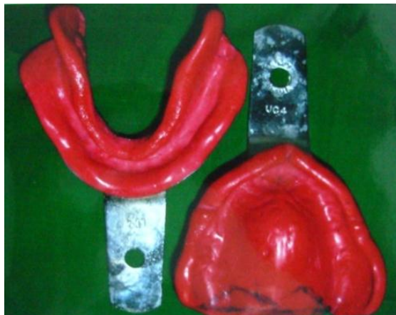
Fig. 2. Preliminary Impression