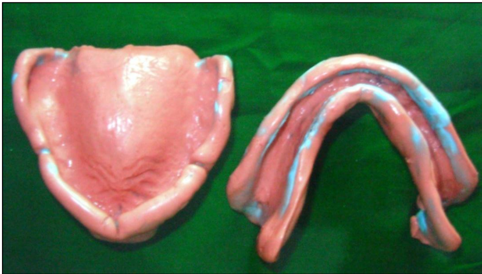
Fig. 5. Secondary Impression Made Using Light Body Impression Material