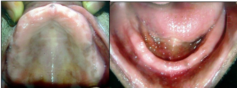
Fig 1. Edentulous arches a) Maxillary b) Mandibular