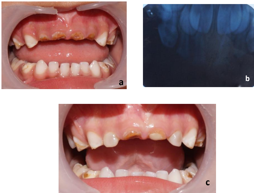
Fig 1: (a) Intraoral photograph wrt 52, 51, 61 and 62. (b) IOPA wrt 52, 51, 61 and 62 (c) Strip crowns wrt 52 and 62