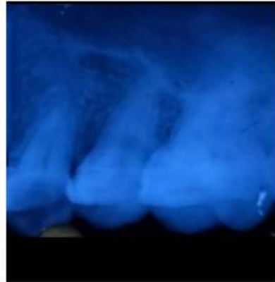
Figure 1B (Preoperative radiograph)