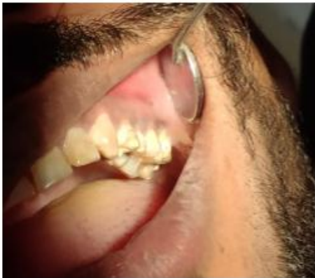
Figure 1C (After 1 week)