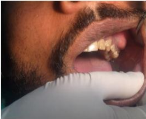
Figure 1A (Intraoral swelling)

cleaning of the root canals, the canals were dried using absorbent points and obturation was done with 6% #25 Gutta-percha using single cone technique and AH plus sealer(Figure 1 D). Clinical and radiographic evaluation showed no pain or sensitivity to palpation and percussion with complete healing of the lesion in relation to tooth #24.