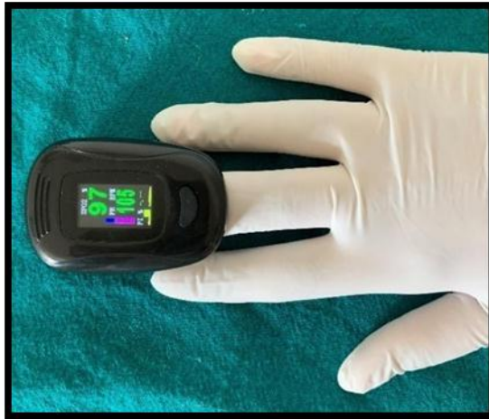
Figure-3: (Individual with latex gloves)original