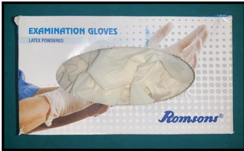
Figure-2: (Latex gloves)original