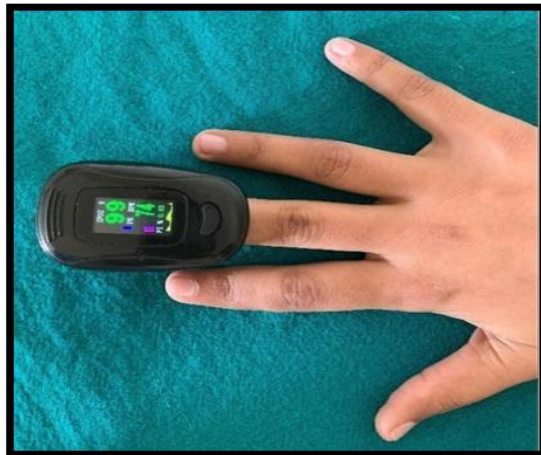
Figure-4: (Individual without latex gloves)original