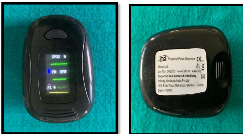
Figure-1: (Pulse Oximeter) original