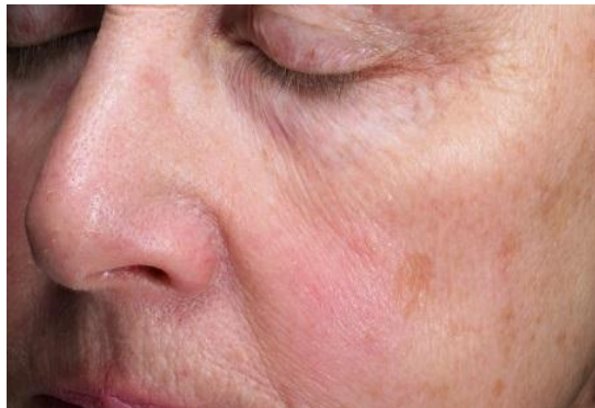
Figure No. 3: Patient photo after the study product application in Rosacea/Anti-age group

There are also statistically significant differences for the indicator “red spots” (right side) in both stages between 1 st and 2 nd measurement ( p = 0.014 ) and 1 st and 3 rd measurement ( p = 0.046 ). Comparing the results of Rosacea/Acne group against the results of skin analysis of the participants of Placebo group (Table No 2), the 2 nd facial analysis session demonstrates worsening in the condition of skin texture and wrinkles, as well as in porphyrins and red spots, and only for texture and wrinkles there are improvements detected at the 3 rd facial analysis session.