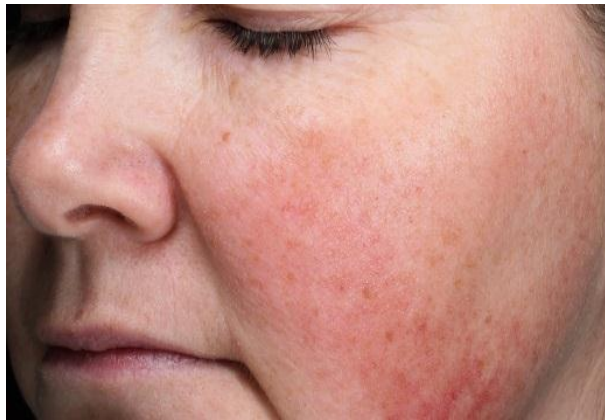
Figure No. 7: Patient photo after the study product application in Anti-age group

The comparative analysis of the results for participants of Anti-age group versus Placebo group demonstrate that overall, there are similar tendencies in detected changes in skin condition (Table No 3).