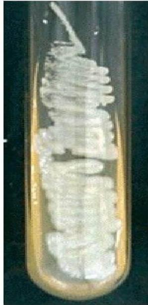
Figure 3: Creamy color colonies of C. neoformans on Sabouraud's dextrose agar