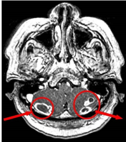
Figure 1: Multiple ring-enhancing lesions of the inferior cerebellum with four discrete lesions