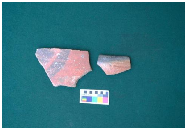
Fig: 5 Black on Red & Black & Red Ware, Pangaon site