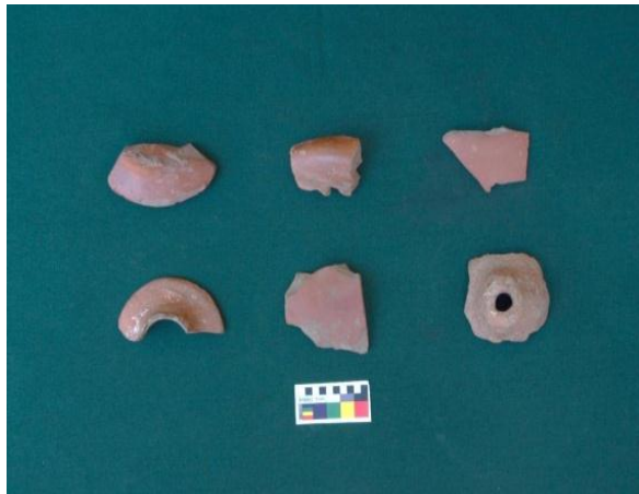
Fig: 2 Red Polished Ware, Pimpalgaon Site