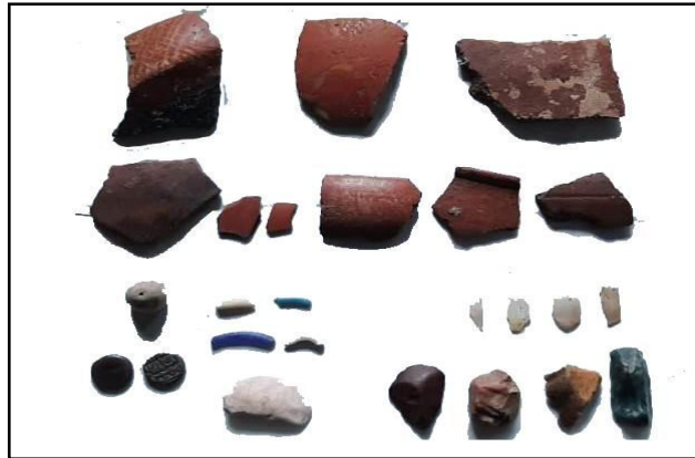
Fig: 8 Antiquity & Potsherds, Goudgaon site