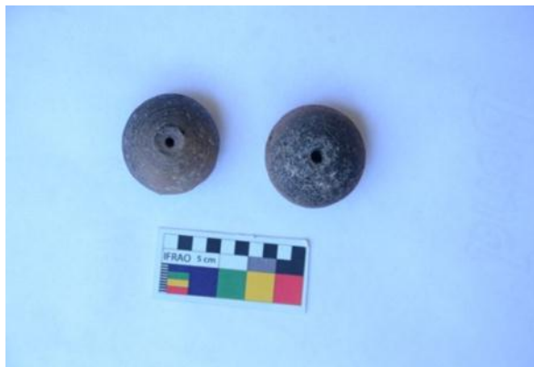
Fig: 3 Arecanutshaped beads, Pimpalgaon site