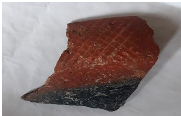
Fig:7 Black & Red Ware with Criss-cross design, Goudgaon site