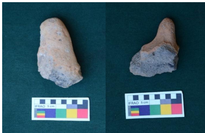
Fig: 4 Broken part of Figurine, Pimpalgaon site