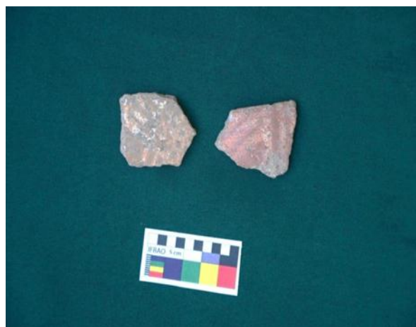
Fig. 1 Criss-cross painted pottery, Zadi Site