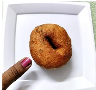
Figure 1. Image of food with thumb as a reference object

Any reference object, such as a coin, cube, card, or thumb, whose size is known in advance, can be used as a real time calibration to estimate the food region. In our paper we had used thumb due to its high availability and ease (Parisa Pouladzadeh, 2014). Size of the thumb is already known in advance during registration process and it can be used as a standard measurement for comparing the extracted area of food region from the given image. Food image with Reference object thumb is shown in Figure 1.