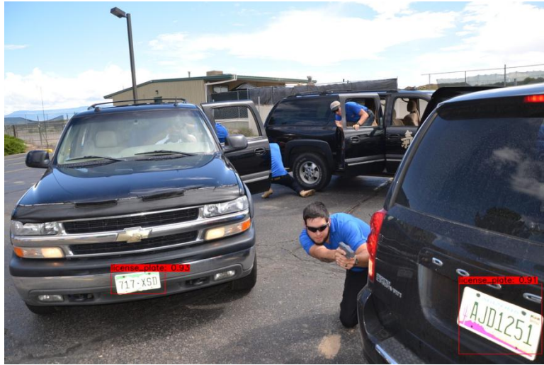
Fig. 4: Bounding Box Around a Car

To forecast the height, width, center, and class, YOLO uses a single bounding box regression as shown in the image given in figure 4.