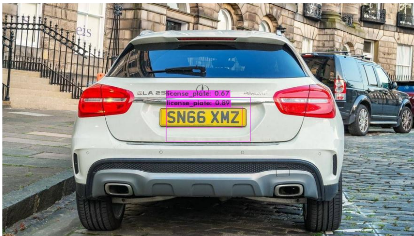
Fig. 5: Two Bounding Boxes Around the Number Plate

The concept of intersection over union (IOU) illustrates how boxes overlap in object detection. IOU is used to create a final result box that completely surrounds the object. Each grid cell calculates the confidence scores of each bounding box. If the observed and actual bounding boxes are the same, the final value IOU is given as 1. This method removes the irrelevant bounding boxes which do not cover the whole object.