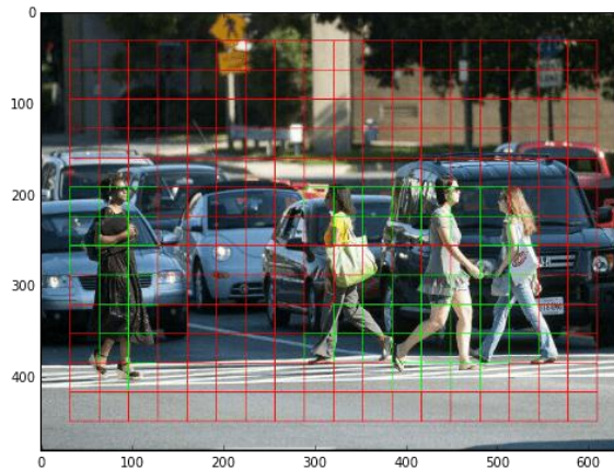
Fig. 3: Dividing Image into Grids

In Residual blocks technique, the image is separated into several grids. Let's consider the dimensions of each grid as N \times N . The graphic below shows how a grid is created from an input image.