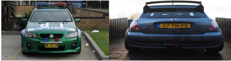
Fig. 1: Example of Images of Datasets Having Appropriate Lighting and Angles

The quality of dataset plays a very important role in the accuracy of the model. The model training is done with lots of variation in the images. The deep Learning model needs a huge amount of data to effectively train the model. The Images collected in our dataset are of good quality and it shows a required corpus size to train the YOLO model.