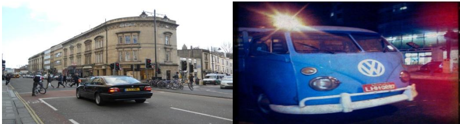
Fig. 2: Our Dataset with Different Angles, Lightings, Distance and Variations