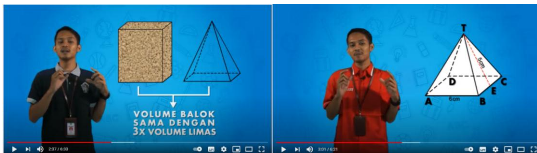
Figure 2. Sample learning video uploaded on youtube channel

Both groups were given the same mathematical learning topics. However, the experimental group was taught using learning videos and ppt slides uploaded online. The in-class learning activities focused on peer discussion of doing practice and problem-solving. The teacher provided the students in the control group with in-class activities.