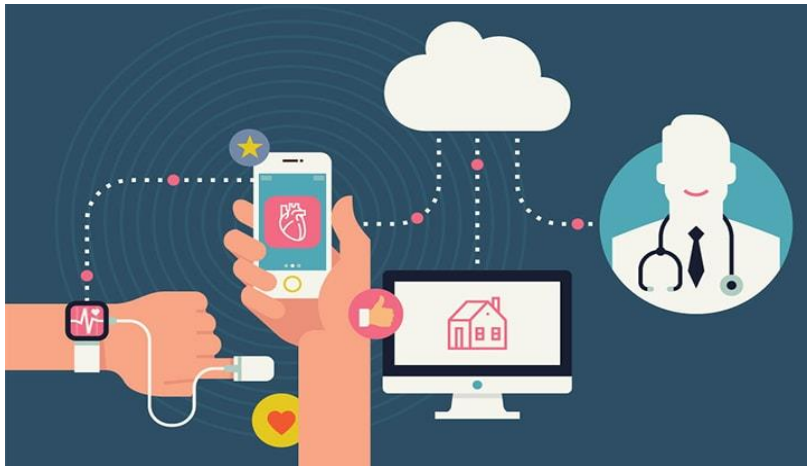
Figure 3. Applications of IoT In Healthcare

money. Health and fitness management, illness diagnosis, personal care for children and the elderly, and chronic disease monitoring are all examples of HIoT applications that have been influenced by the Internet of Things (IoT) in recent years. For a better understanding of these apps, they have been broken down into two main categories: services and applications. There are two types of HIoT devices: those that are being developed for the purpose of building an HIoT device, and those that are being utilised for healthcare purposes. It has been explained in depth in the following sections how HIoT services and applications may benefit your business. The wide range of applications for IoT in numerous fields makes it a highly anticipated development for a wide range of people. A variety of healthcare-related uses exist for it. In healthcare, the Internet of Things (IoT) is being used to great effect.