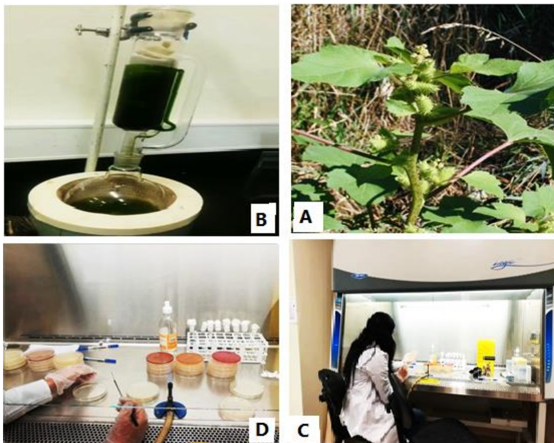
Figure (1): Steps of work A- whole plants; B- extract by Soxhlet apparatus; C- incubator D- well diffusion method by using petri dishes .