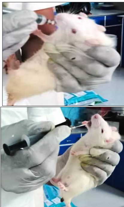
Fig 1. Images during experimental work