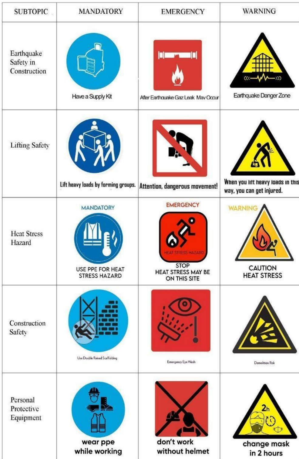
Figure 3. Selected pictogram designs of occupational health and safety students