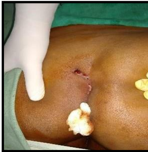
Fig 2: Preoperative picture showing Pilonidal Sinus Complex with lateral extension