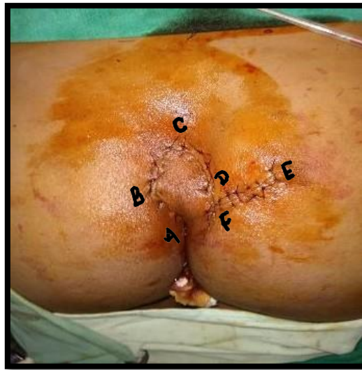
Fig 5: After skin closure in Limberg Flap Reconstructions