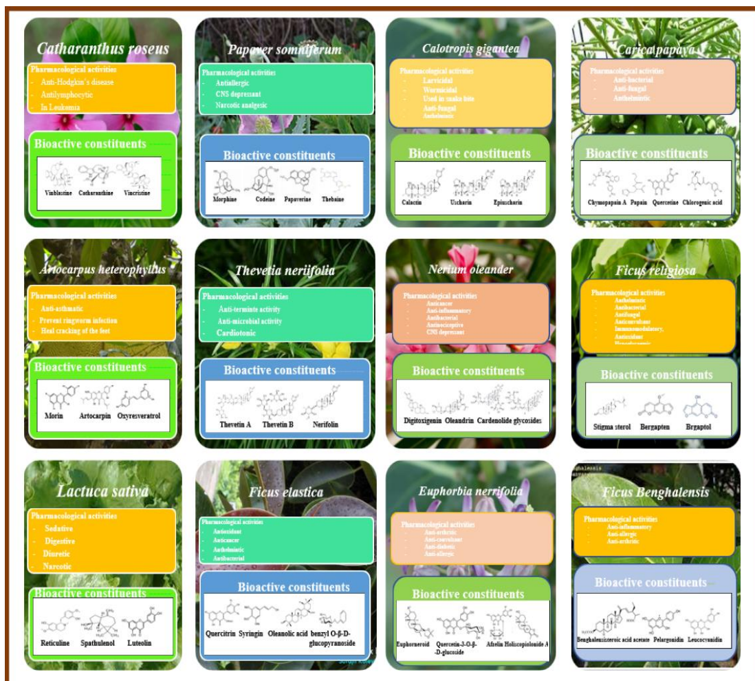
Figure 1. List of latex containing plants and their therapeutic uses and responsible bioactive constituents