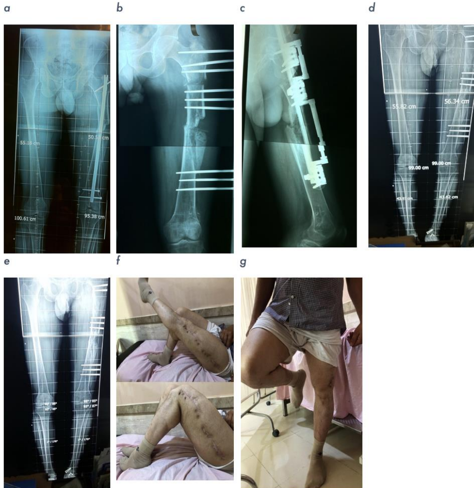
Fig. 2. Follow-up radiographs and clinical views of 46 years old male patient, sustained comminuted fracture left femur, which had been treated previously by debridement, open reduction and internal fixation using IMN, with about 5 cm shortening (A). AP and lateral X-rays illustrate removal of nail, osteotomy and application of LRS (B-C). The Final scanogram (D-G). and clinical image (f-g-h) show the patient with restored length and alignment with excellent function after the end of treatment.

show the patient with full weight bearing and 90 degrees knee flexion. after the end of treatment.