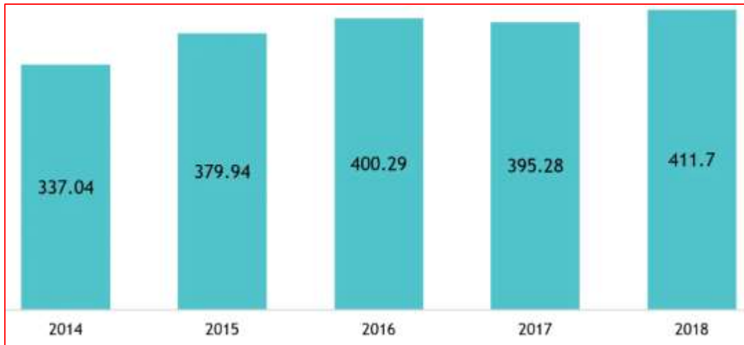
Figure 1. Gross Domestic Product (GDP) from Thai Construction Industry

Bangkok is the hub of construction industry because there are lot of business opportunities related to the construction business. With the increase in business industry of Thailand (Soparat, Wangapisit, & Trangkanont, 2021) the construction industry is also growing significantly. The national and international investment is increasing in Bangkok which is also leading to generate several business opportunities related to the construction industry. Therefore, it is important to highlight the construction industry of Thailand, particularly related to the Bangkok. However, the entrepreneurs working in Bangkok construction industry require to increase the rate of success. As the failure rate among the construction industry entrepreneurs is also existing which is needed to address by identifying different factors affecting on business success. In this way the objectives of the study are as follows;