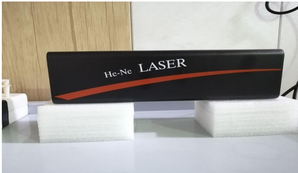
Figure 1: The Helium-Neon Laser

The current study was conducted on 30 semen samples enrolled in this study. They were attending the infertility clinics at High Institute for Infertility Diagnosis and Assisted reproduction Al-Nahrain University .semen samples were taken from patients and classified into two groups according to the criteria of WHO (1999) for semen analysis; the first group is ( 15 ) Asthenozoospermia semen sample and the second group (15 ) normozoospermia semen sample with normal motility subjects who served as normal infertile volunteers these subjects will be admitted to the institute . after the approval of the ethical committee that must be obtained prior to the initiation of the study. Post-activation of each sample will be divided into two aliquots the first one using a laser at the wavelength (632.8mw), figure 1. combined with indirect swim up, the second using ISU technique alone, then sperm parameters were assessed for these two techniques and the results were statistically analyzed.