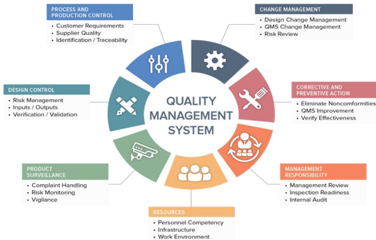
Fig 3. Quality Management System of CDSCO