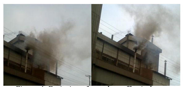
Figure 1. Emissions from the coffee industry

The smoke is dispersed by the wind, occurring that the release of contaminating oily substances are impregnated in the electrical infrastructure, especially in the insulators, that combined with the marine aerosol and the dust coming from the quarries of the construction and of the own conditions of the Create a crust on the elements of the networks