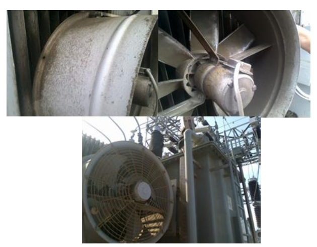
Figure 2. Deposition of the quarry dust in the fans of the substation

During the construction and assembly period of the substation Montecristi II, some samples were taken from the depositions of the already mentioned pollutant emissions. Figure 2 shows an image of the fans of the transformers, where the pollution levels are observed. In this case the majority of the contaminant depositions come from the quarries that are close to the substations under study, that is to say, that preventive maintenance must be done before starting the substation because it is not only the isolators that can be affected because the contamination