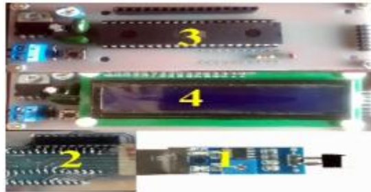
Figure 2. Meat moisture measuring instrument with AT89S52 microcontroller based copper electrode sensor

The design results from the tools obtained from this study are as shown in Figure 2.