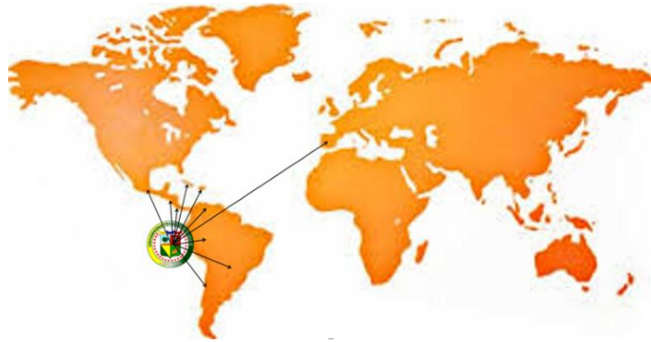
Figure 1 The UTM as center of the network

Currently the UTM's mission is to train academics, scientists and professionals responsible, humanistic, ethical and solidarity, committed to the objectives of national development, which contribute to the solution of the country's problems as a university of teaching and research, capable of generating and applying new knowledge, promoting the promotion and dissemination of knowledge and cultures, provided for in the Constitution of the Republic of Ecuador, with a vision focused on becoming a leading university institution, benchmark of higher education in the country, promoting the creation, development, transmission and dissemination of science, technology and culture, with social recognition, regional and global projection. 7,8 Figure 1 shows the UTM, considering its geographical location, it is in the development phase of several projects that are based on GIS and the philosophy of Geoportals and where it will be the coordinating center of the Ibero-American Geographic Information Network for sustainable development.